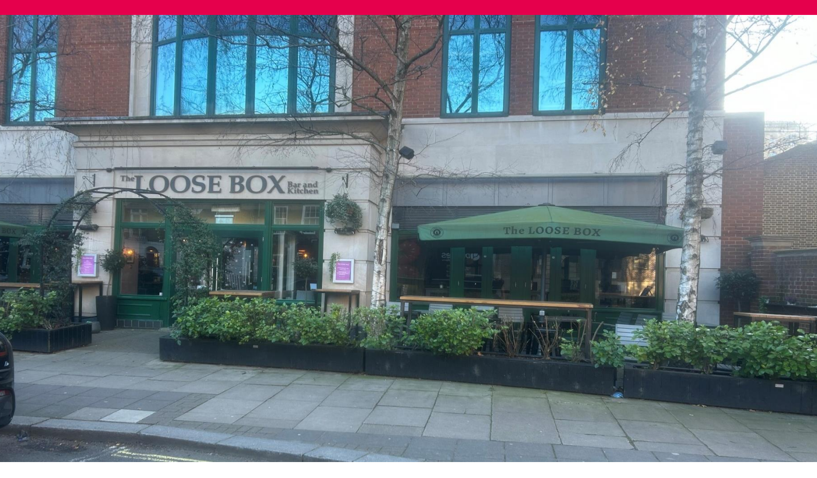
Loose Box, 51 Horseferry Road, London SW1P 2AA