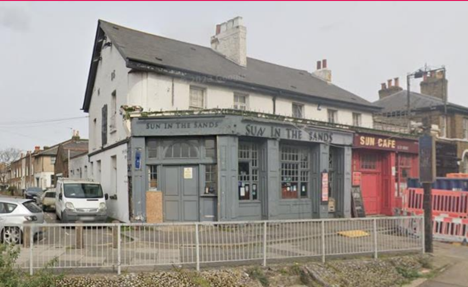
Sun in the Sands, 123 Shooters Hill Road, London SE3 8UQ