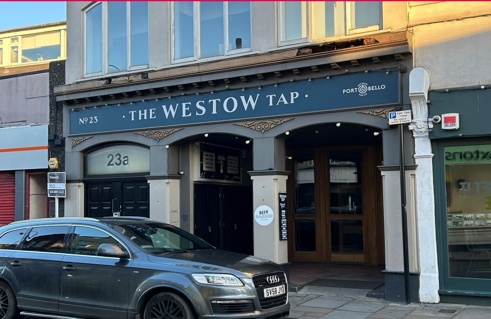
The Westow Tap, 23 Westow Hill, Norwood, London SE19 1TQ

LONG LEASEHOLD FOR SALE (999 YEARS) GROUND FLOOR AND BASEMENT ONLY CRYSTAL PALACE, SE19