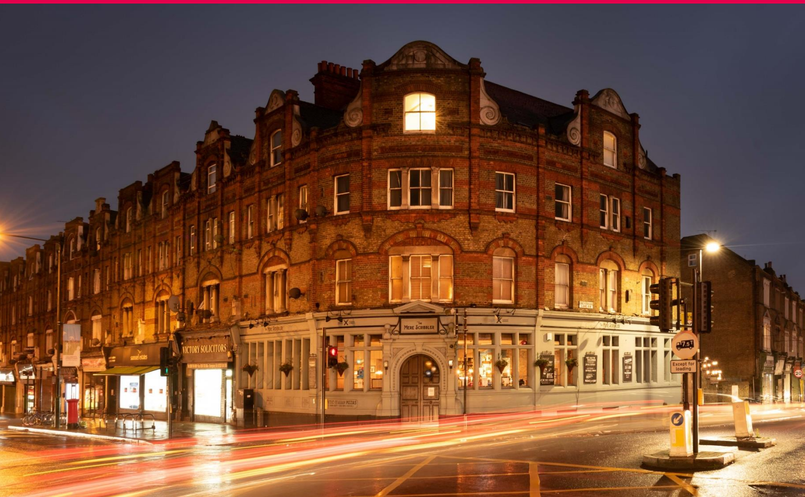
Mere Scribbler, 426 Streatham High Rd, London SW16 3PX