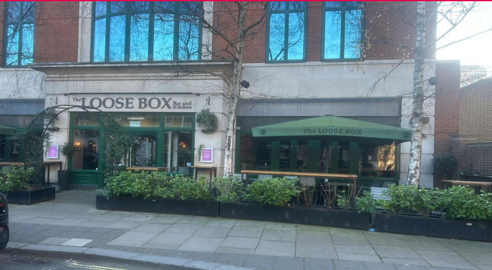
Loose Box, 51 Horseferry Road, London SW1P 2AA