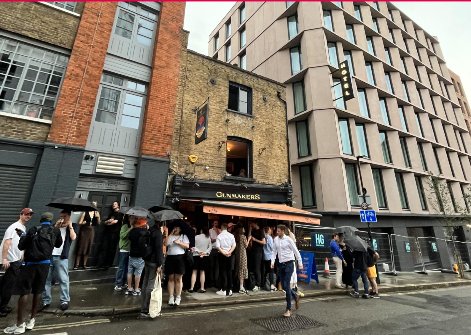
The Gunmakers, 13 Eyre St Hill, Clerkenwell, London EC1R 5ET