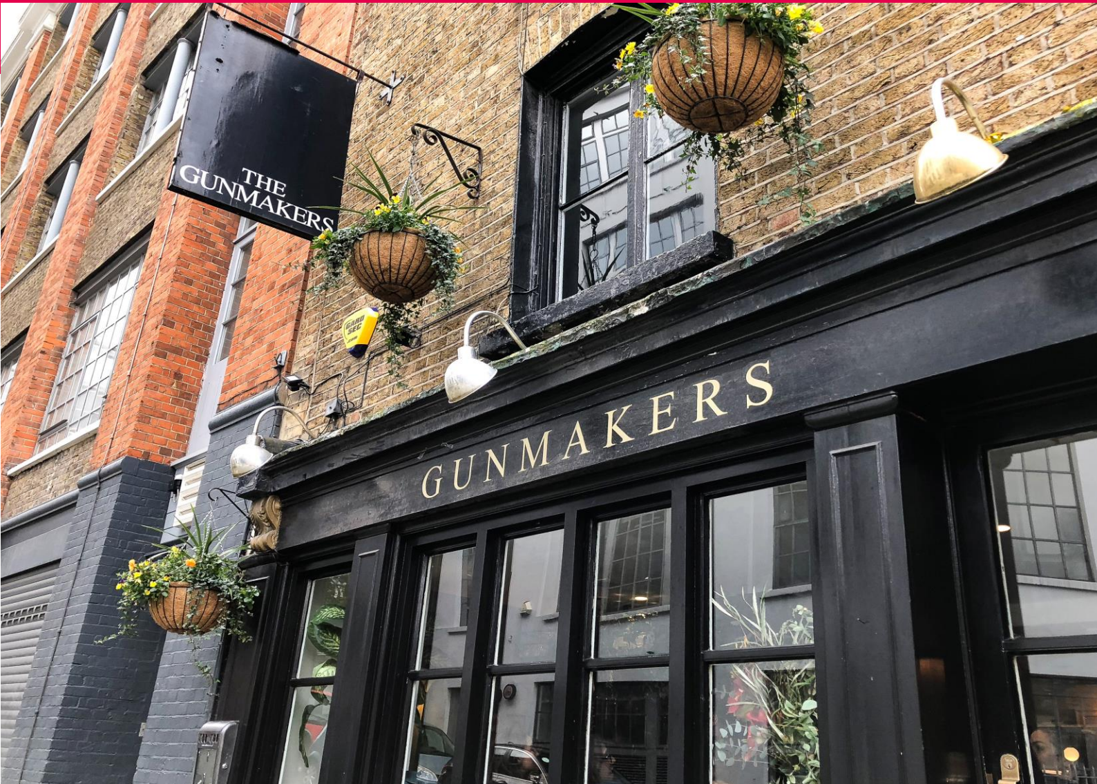
The Gunmakers, 13 Eyre St Hill, Clerkenwell, London EC1R 5ET