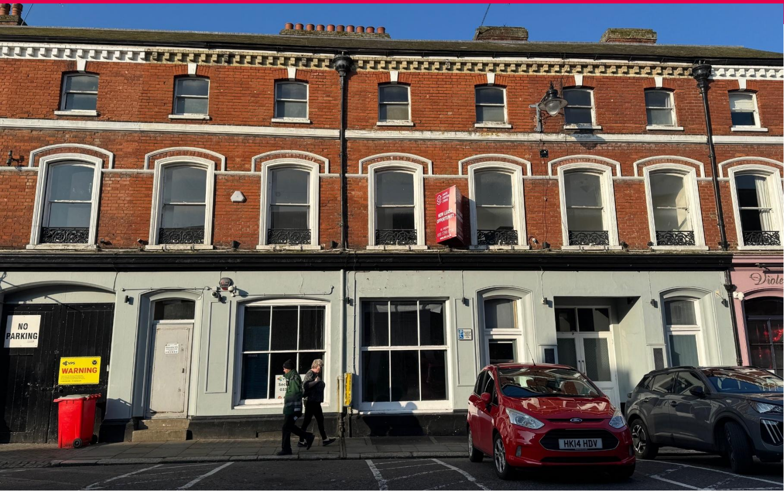
The Stone House, 7-11 Bull Plain, Hertford SG14 1DY