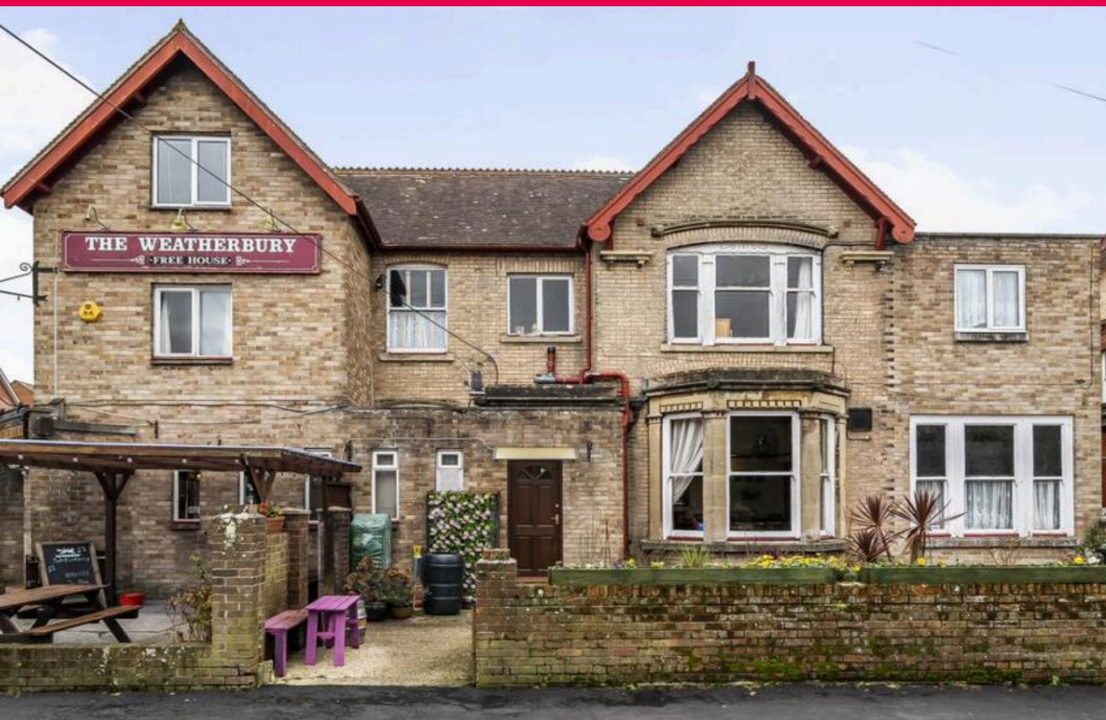
The Weatherbury, 7 Carlton Road North, Weymouth DT4 7PX