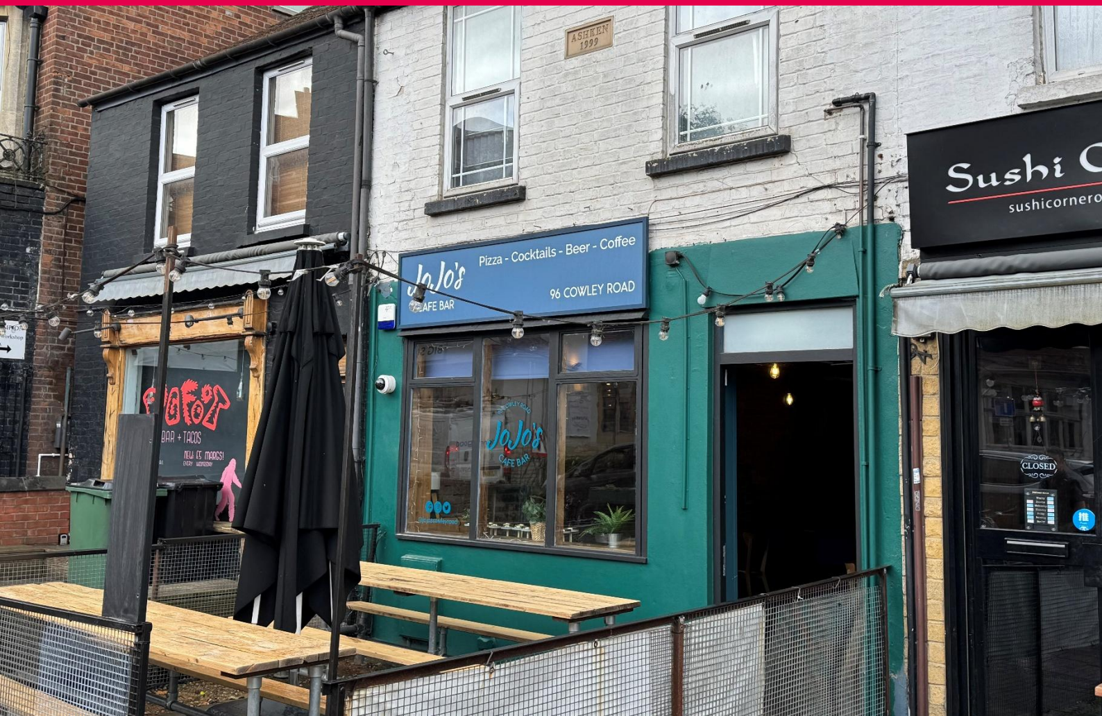
JoJo's, 96 Cowley Road, Oxford OX4 1JE