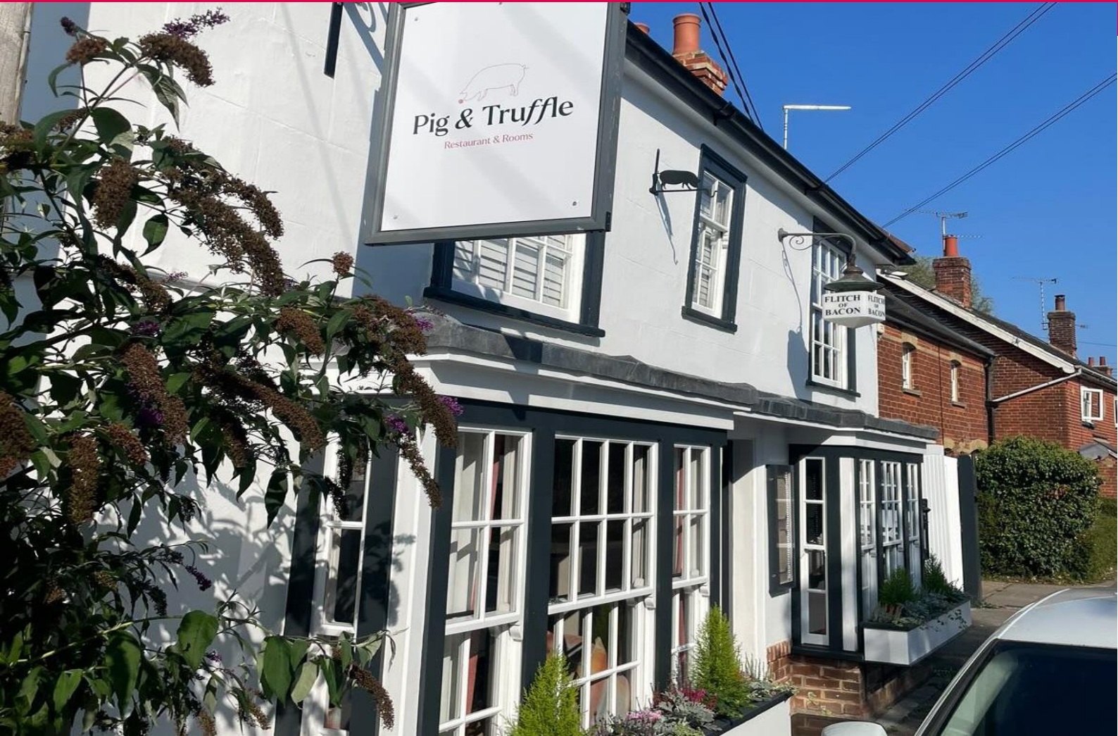
Pig & Truffle, The Street, Little Dunmow, Essex CM6 3HT