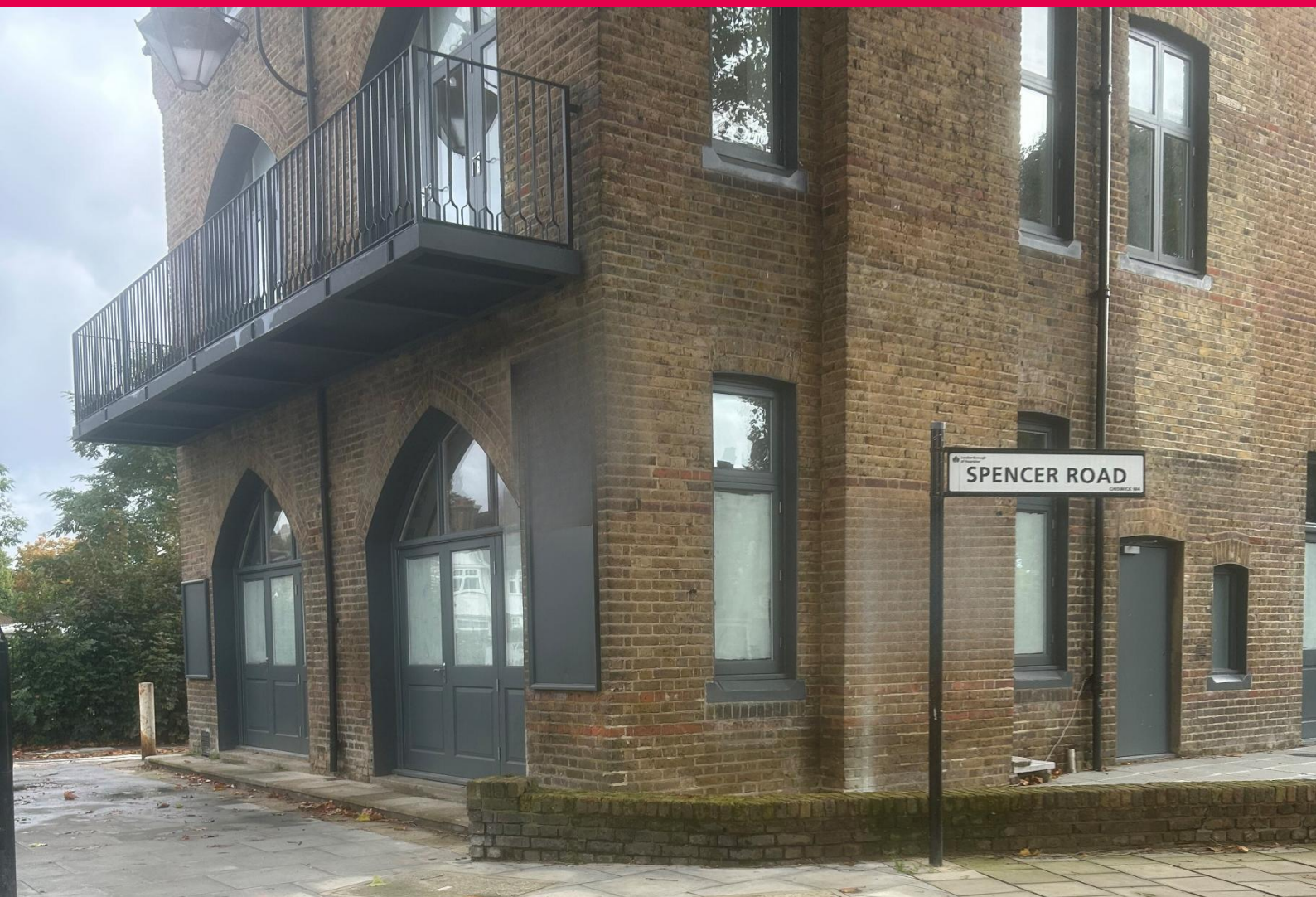
Station House, 2 Grove Park Road, Chiswick, London W4 3SG