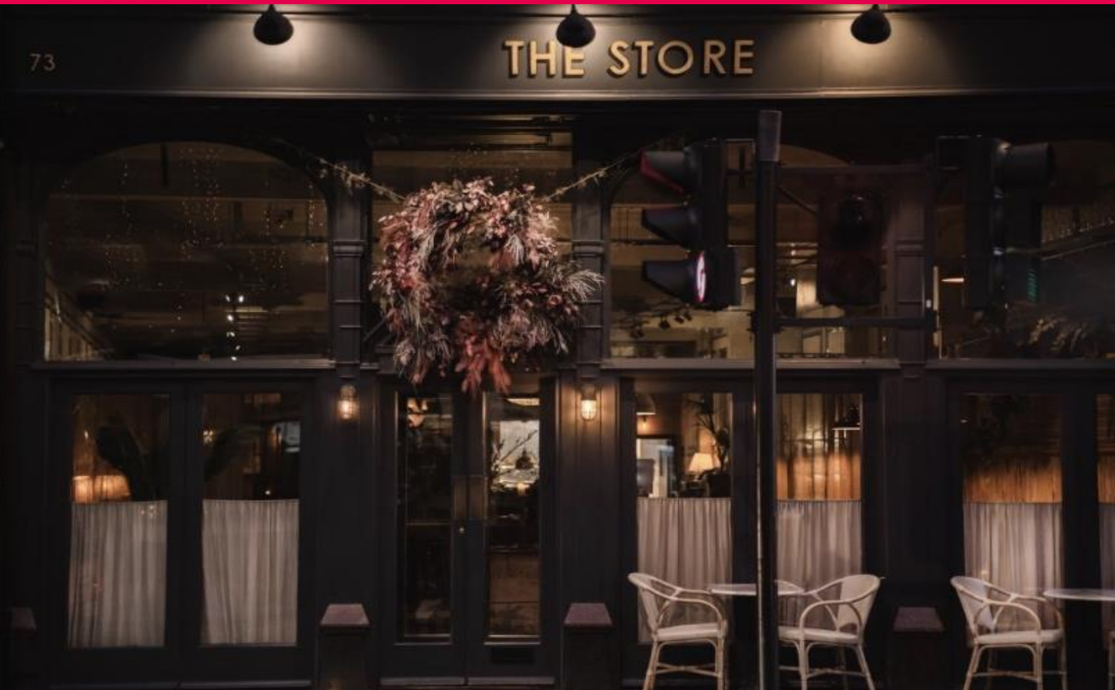
The Store, 73 South End, Croydon CR0 1BF