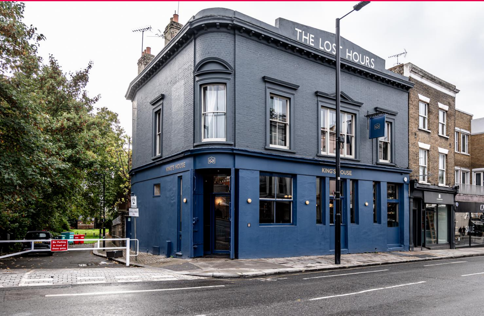
The Kings House 541 Kings Road, London SW6 2EB