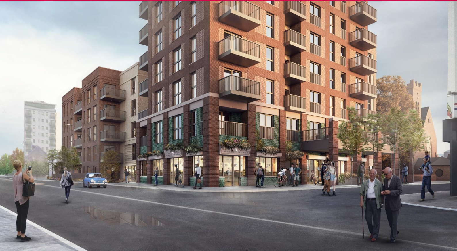
Former White Horse, 118 High Road, Chadwell Heath RM6 6NU