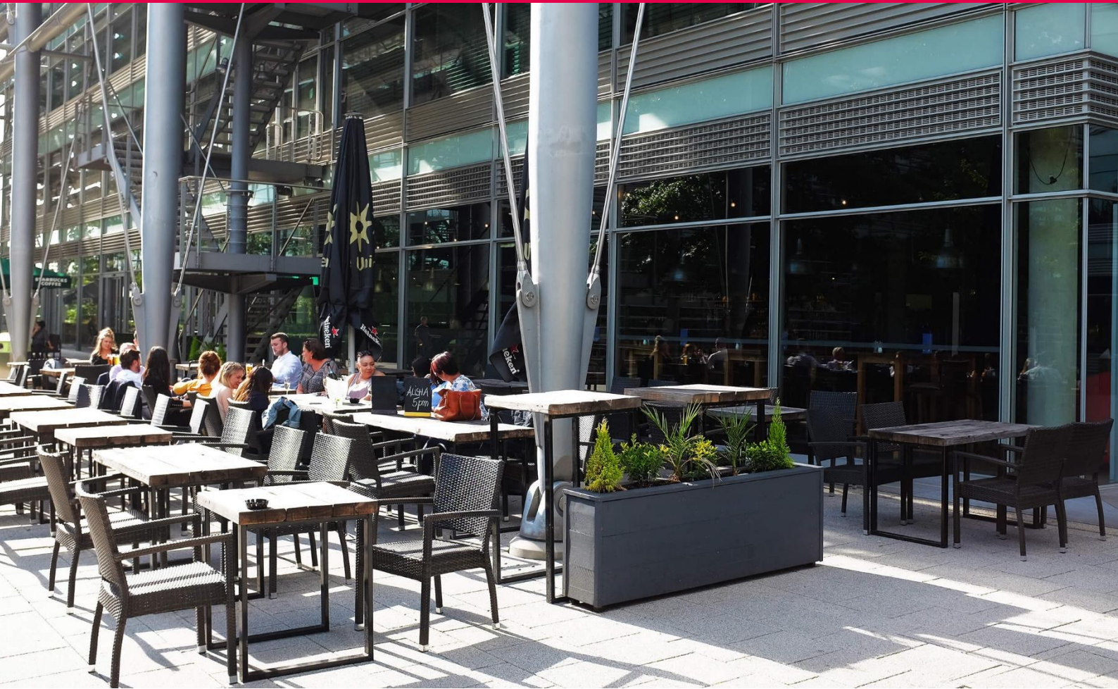
Building 5, 566 Chiswick Park, Chiswick High Road, London W4 5YA