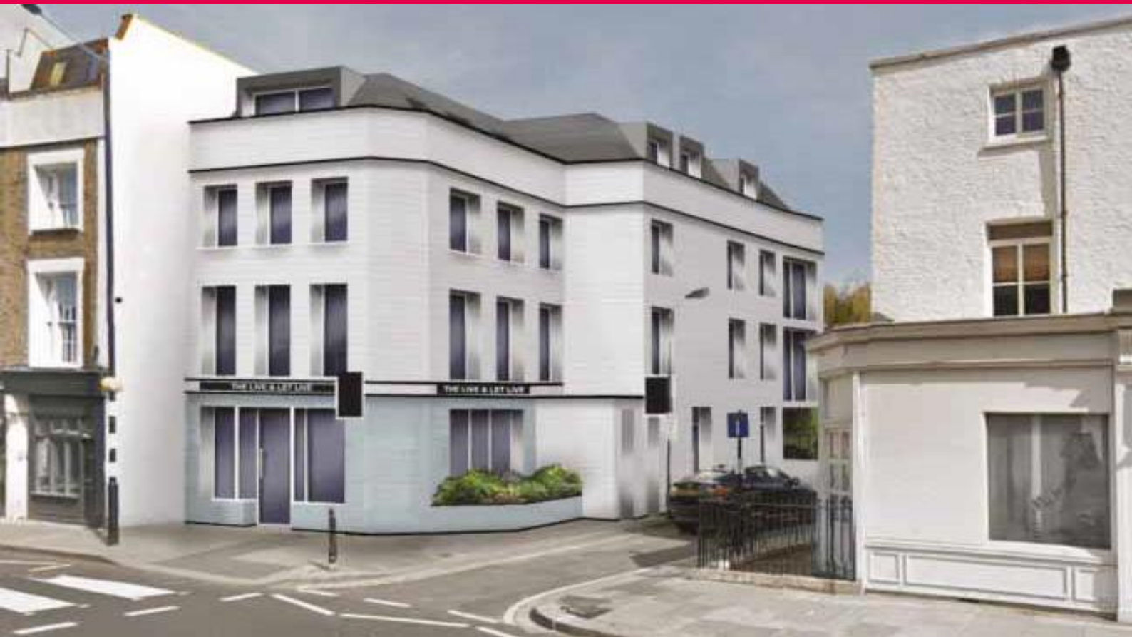
The Live & Let Live, 35-37 North End Road, London, W14 8SZ