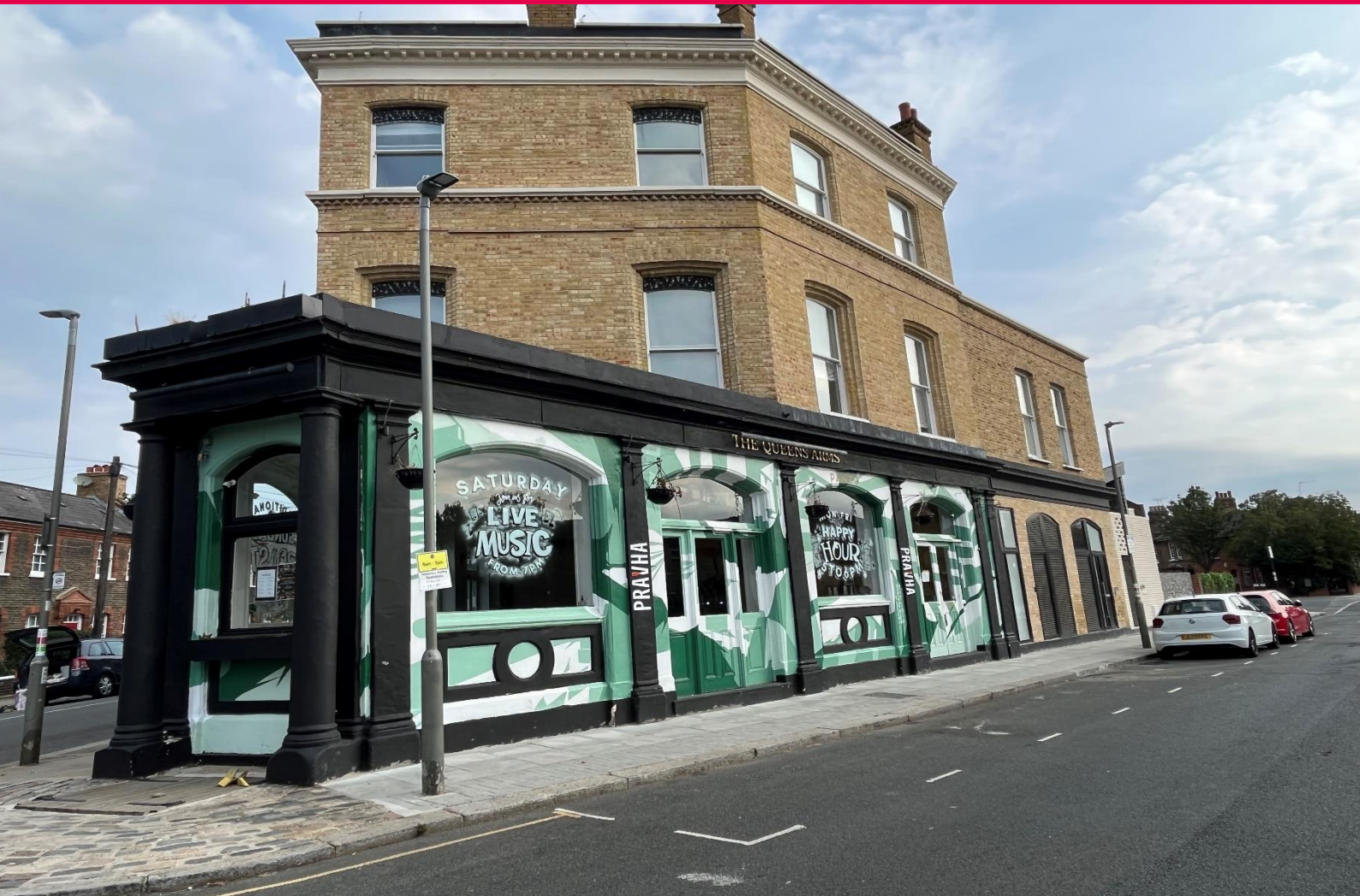
Queens Arms, 139 St Philip Street, Battersea, London SW8 3SS