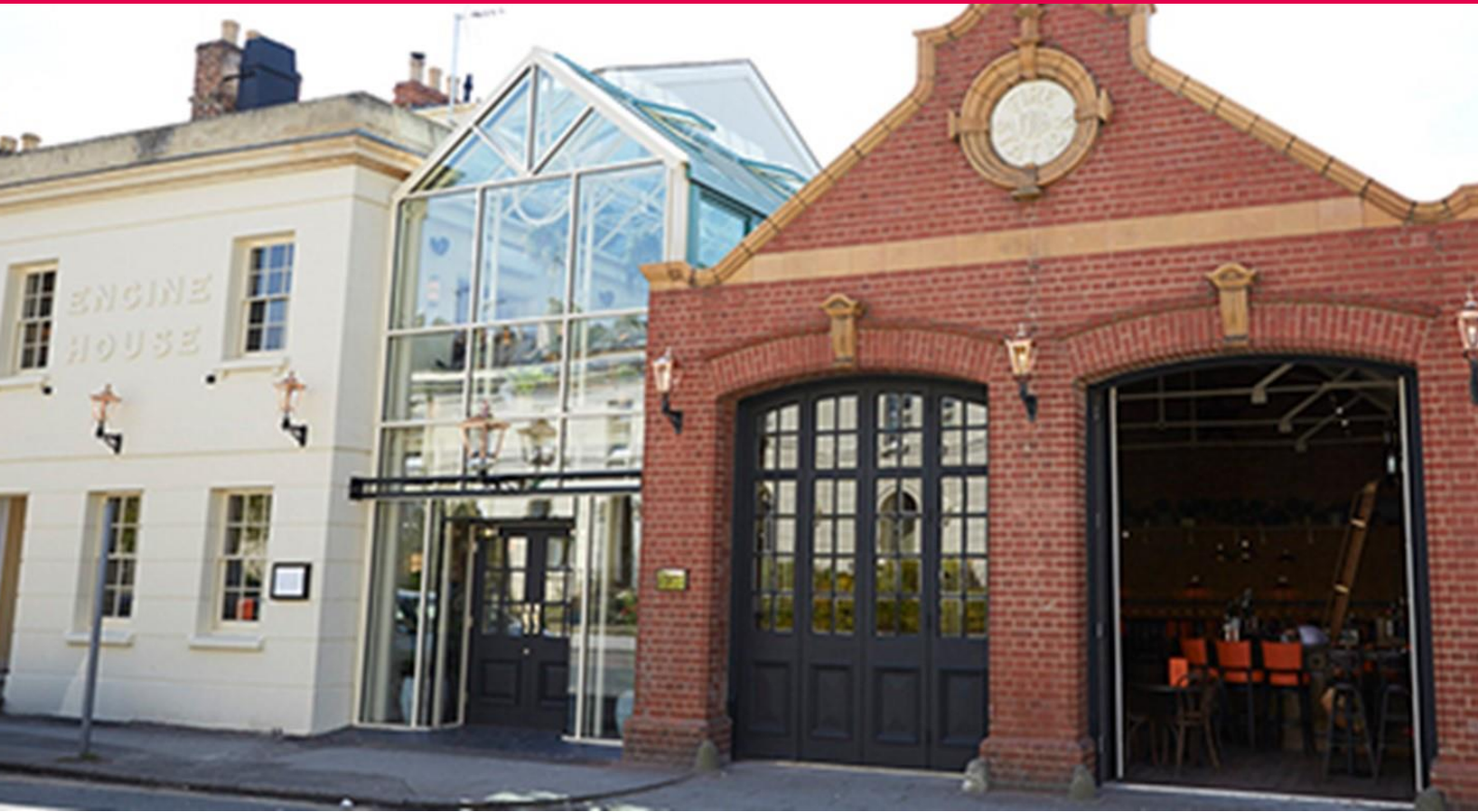
The Fire Station, St James's Square, Cheltenham, Gloucestershire GL50 3PU