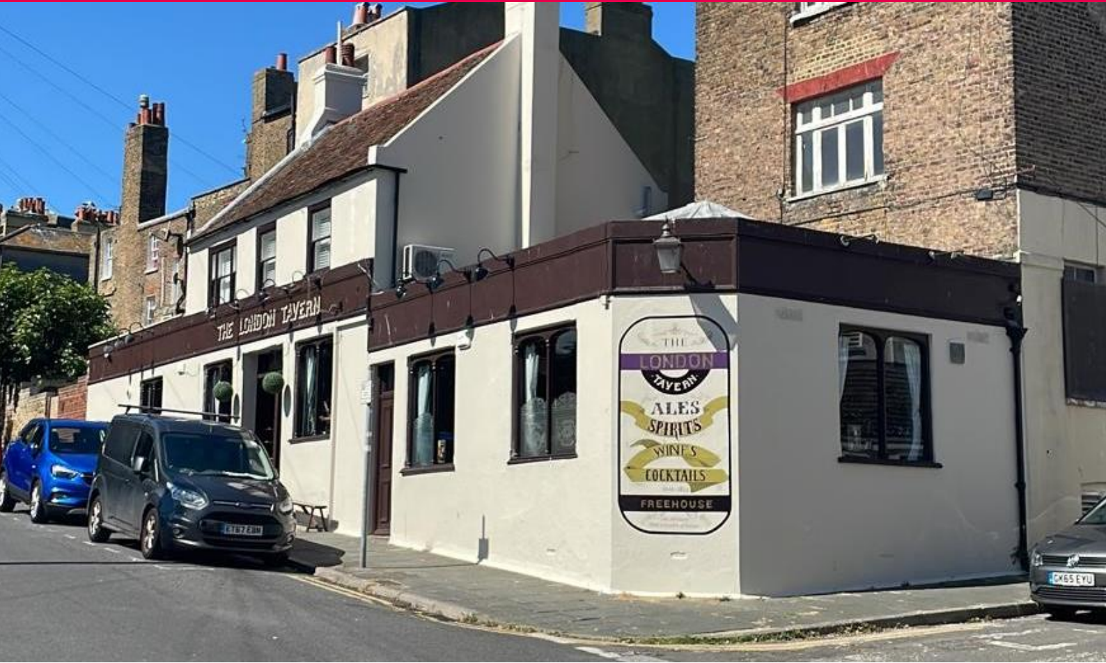
The London Tavern, Addington Street, Margate CT9 1PN