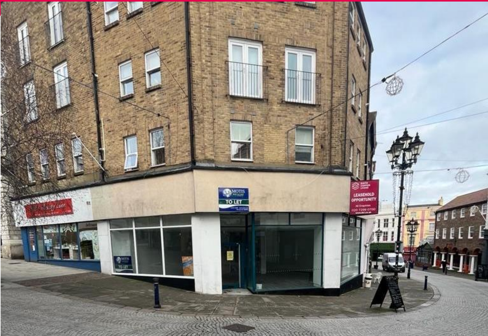
1-3 Rendezvous Street, Folkestone CT20 1EY