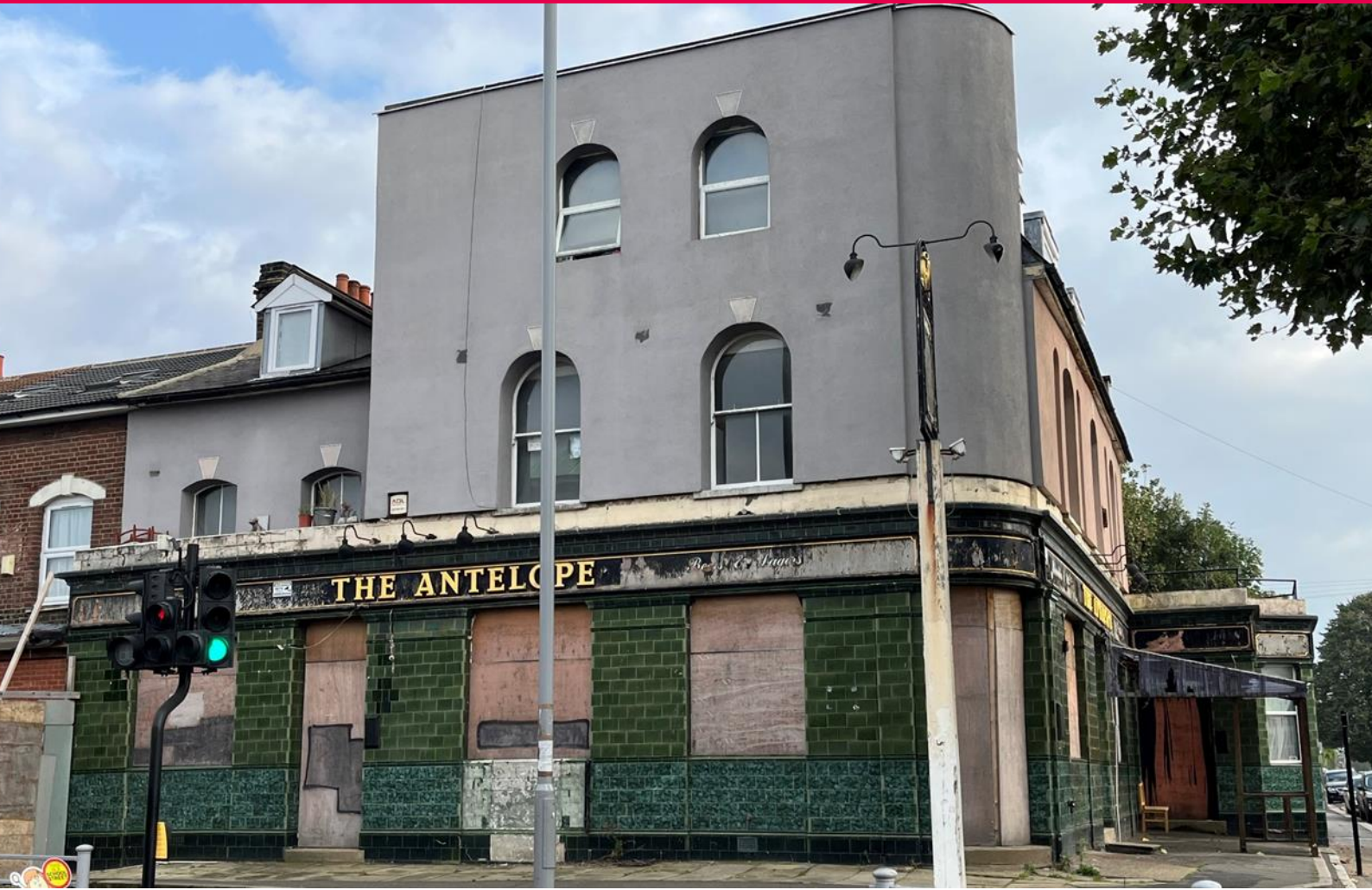
The Antelope, 201 Church Road, Leyton, London E10 7BQ