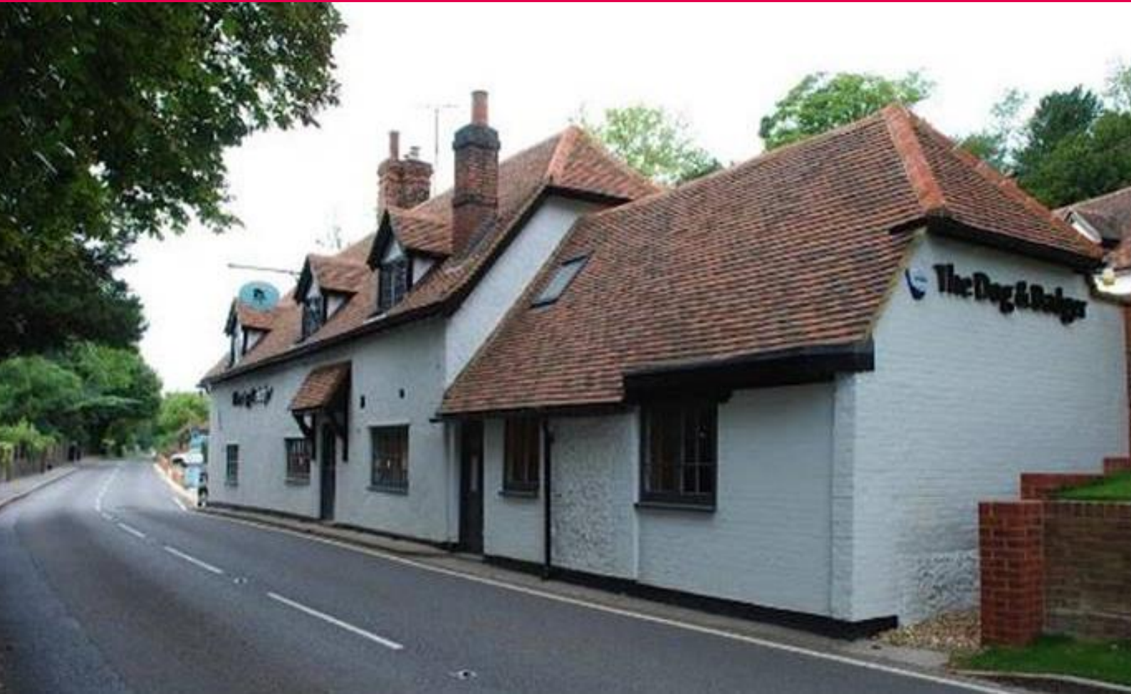
Dog and Badger, Henley Road, Marlow SL7 2HE