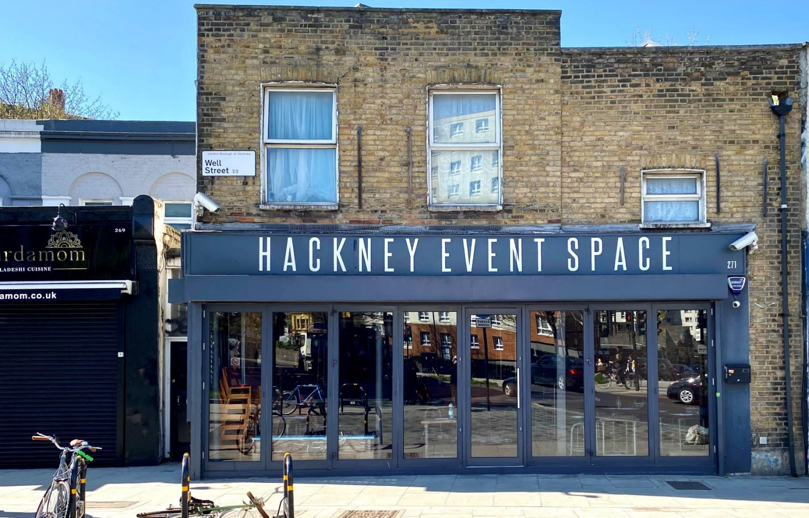
Hackney Event Space, 271 Well Street, Hackney, London E9 6RG