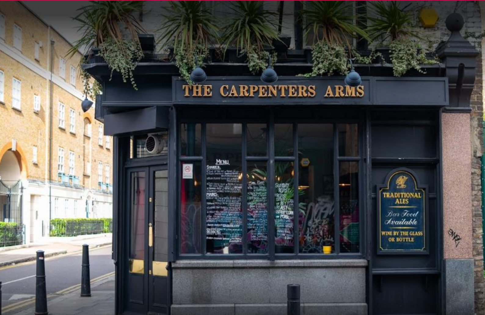
The Carpenters Arms, 73 Cheshire Street, London E2 6EG