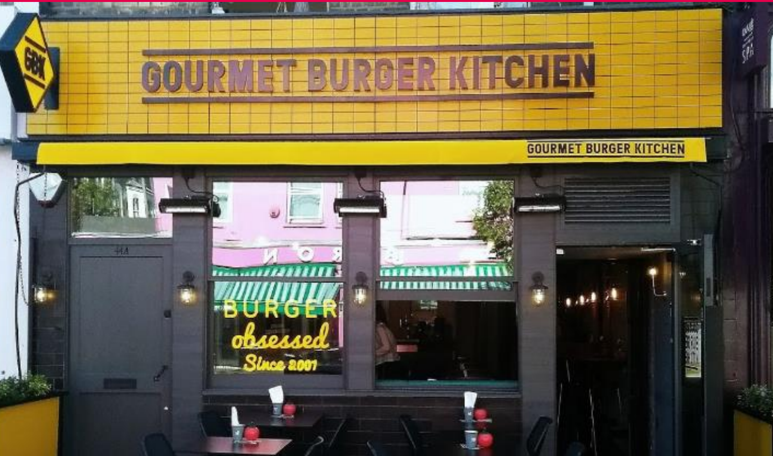
*photo shows frontage of previous operator