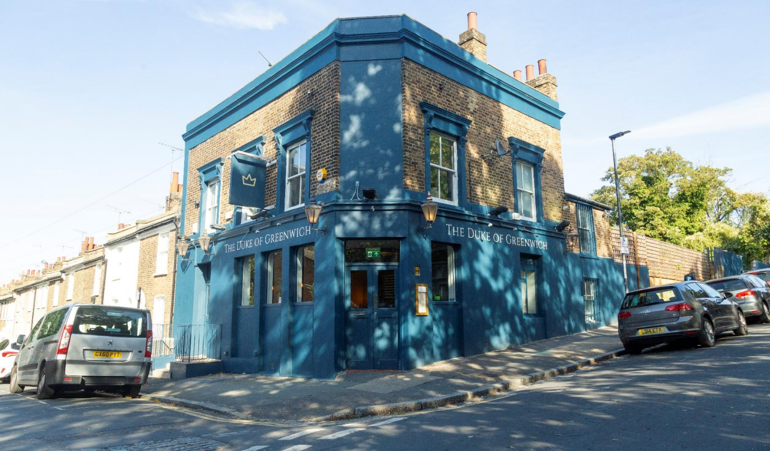
Duke of Greenwich, 91 Colomb Street, London SE10 9EZ