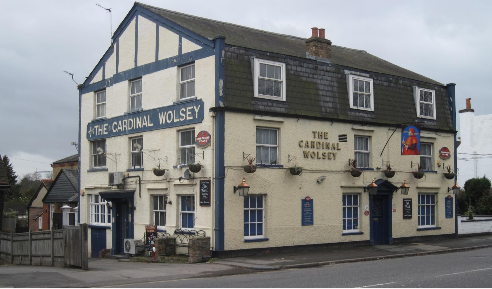
Cardinal Wolsey, Hampton Court Road, Surrey KT8 9BW