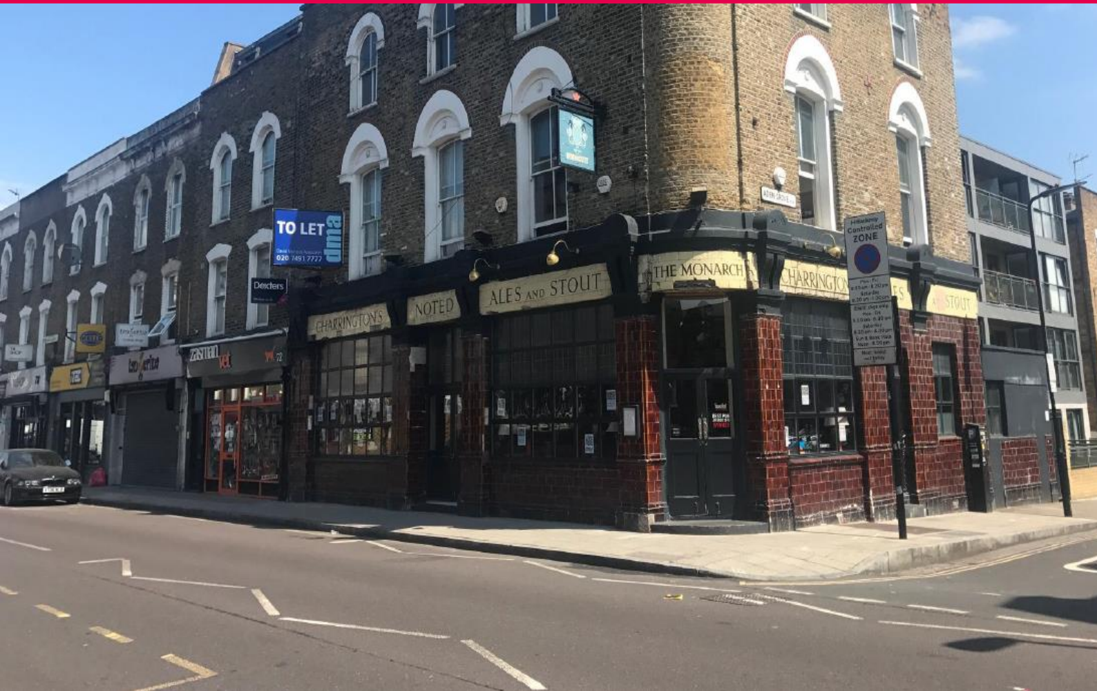
The BeBop Pub, 68-70 Green Lanes, Stoke Newington, London, N16 9EJ