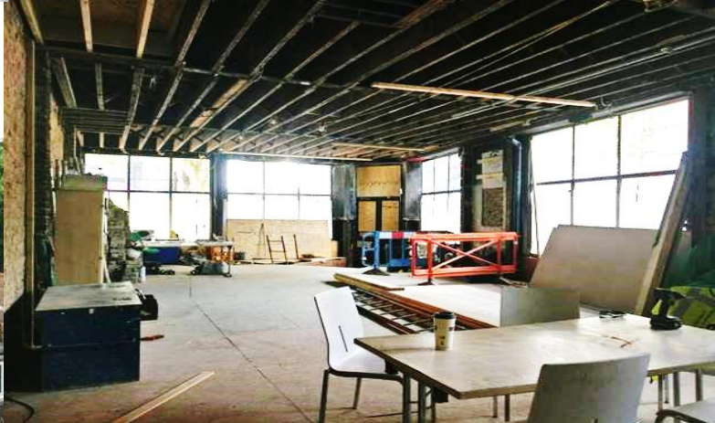
Former Hartley Public House, 64 Tower Bridge Road, London, SE1 4TR