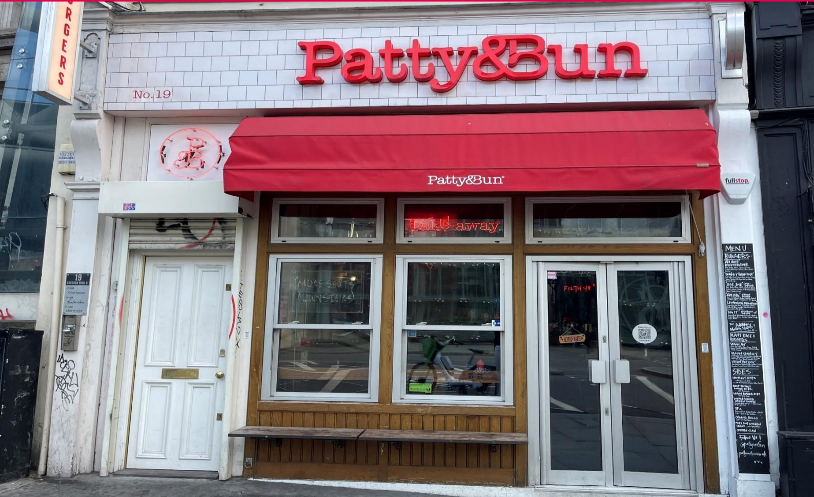
19 Borough High Street, London, SE1 9SE