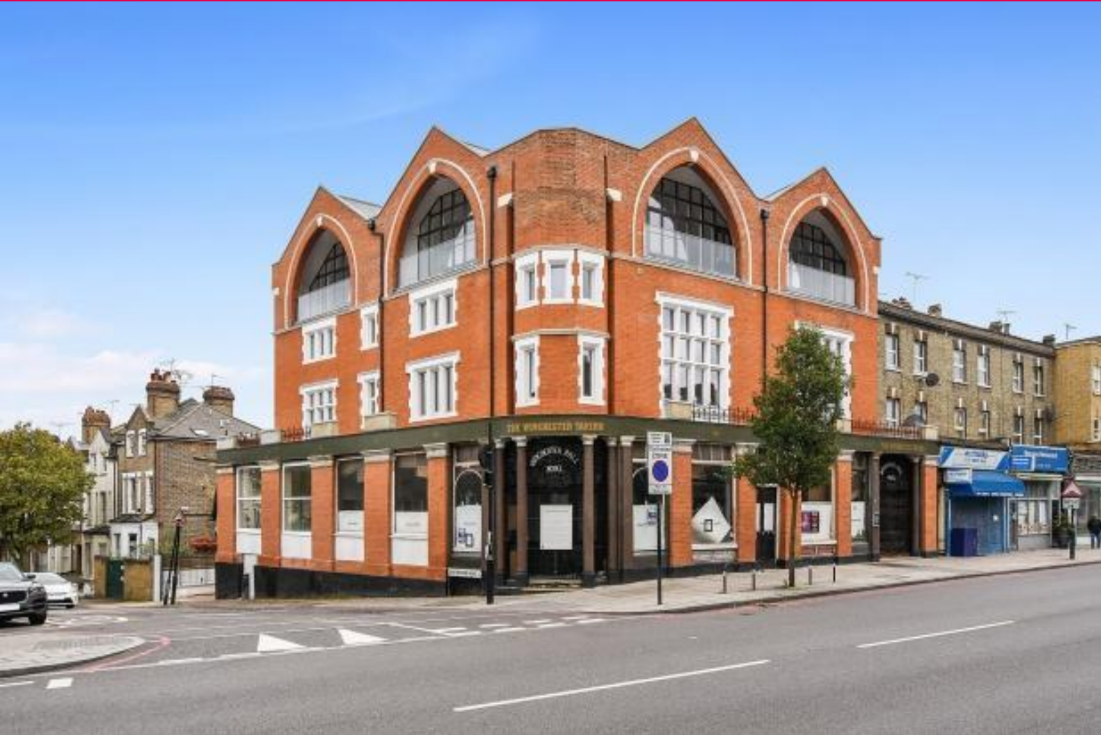
Winchester Hall Tavern, 206 Archway Road, Highgate, London, N6 5BA