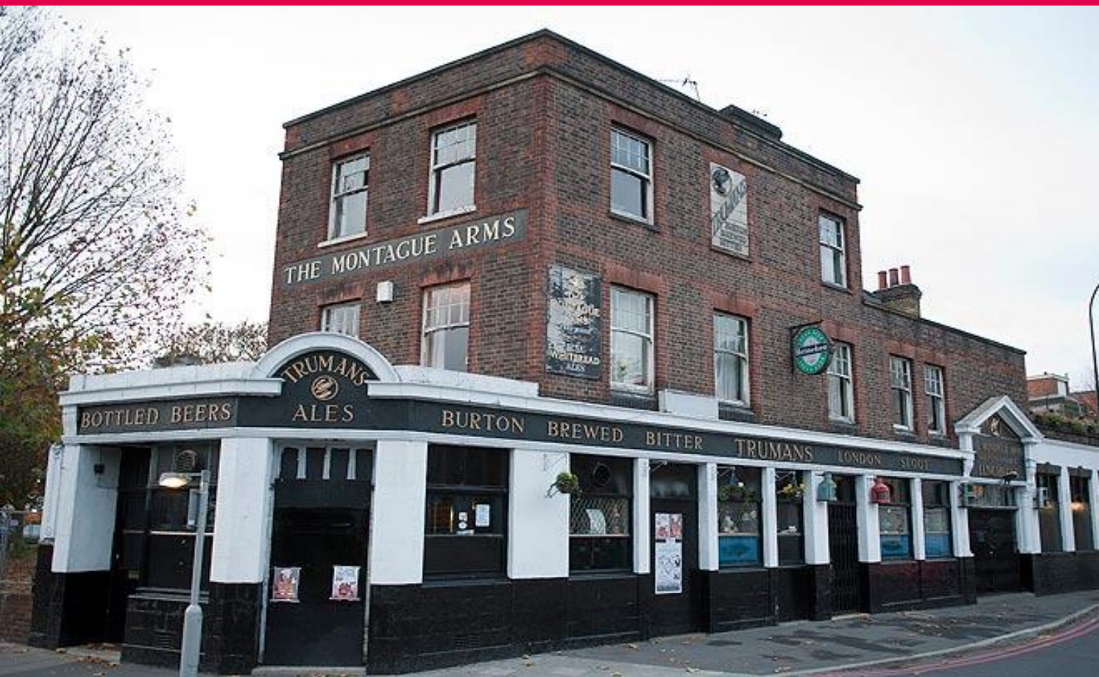
The Montague Arms, 289 Queens Road, London, SE15 2PA