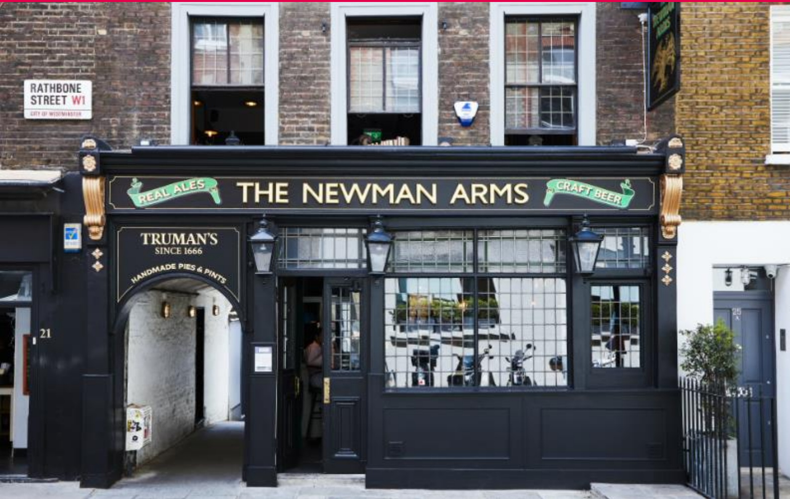
The Newman Arms, 23 Rathbone Street, London W1T 1NG