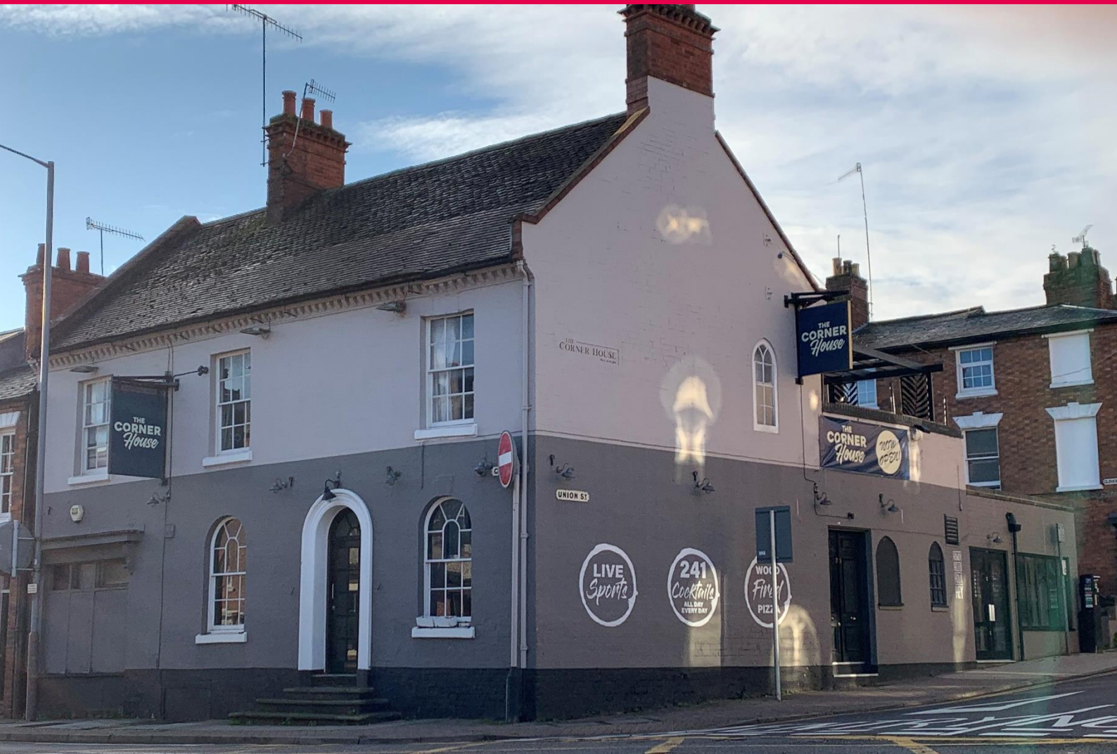
The Corner House, Guild Street, Stratford Upon Avon, Warwickshire CV37 6QY