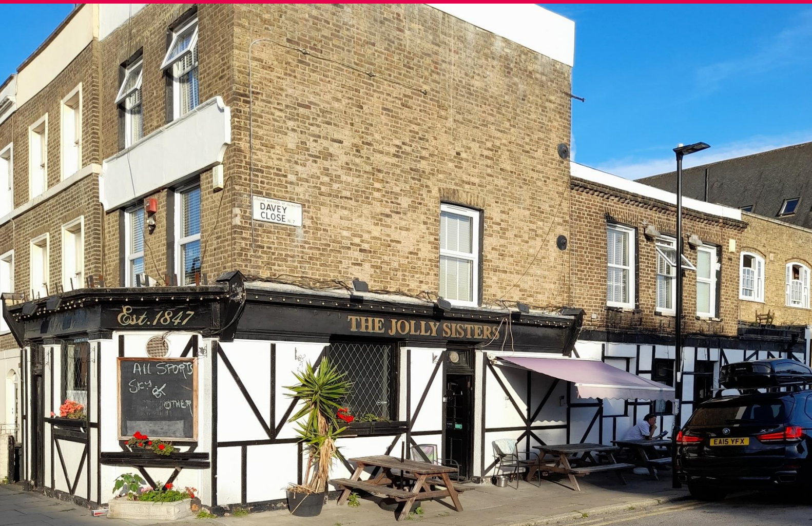
The Jolly Sister's, 95 Bride Street, London N7 8AX