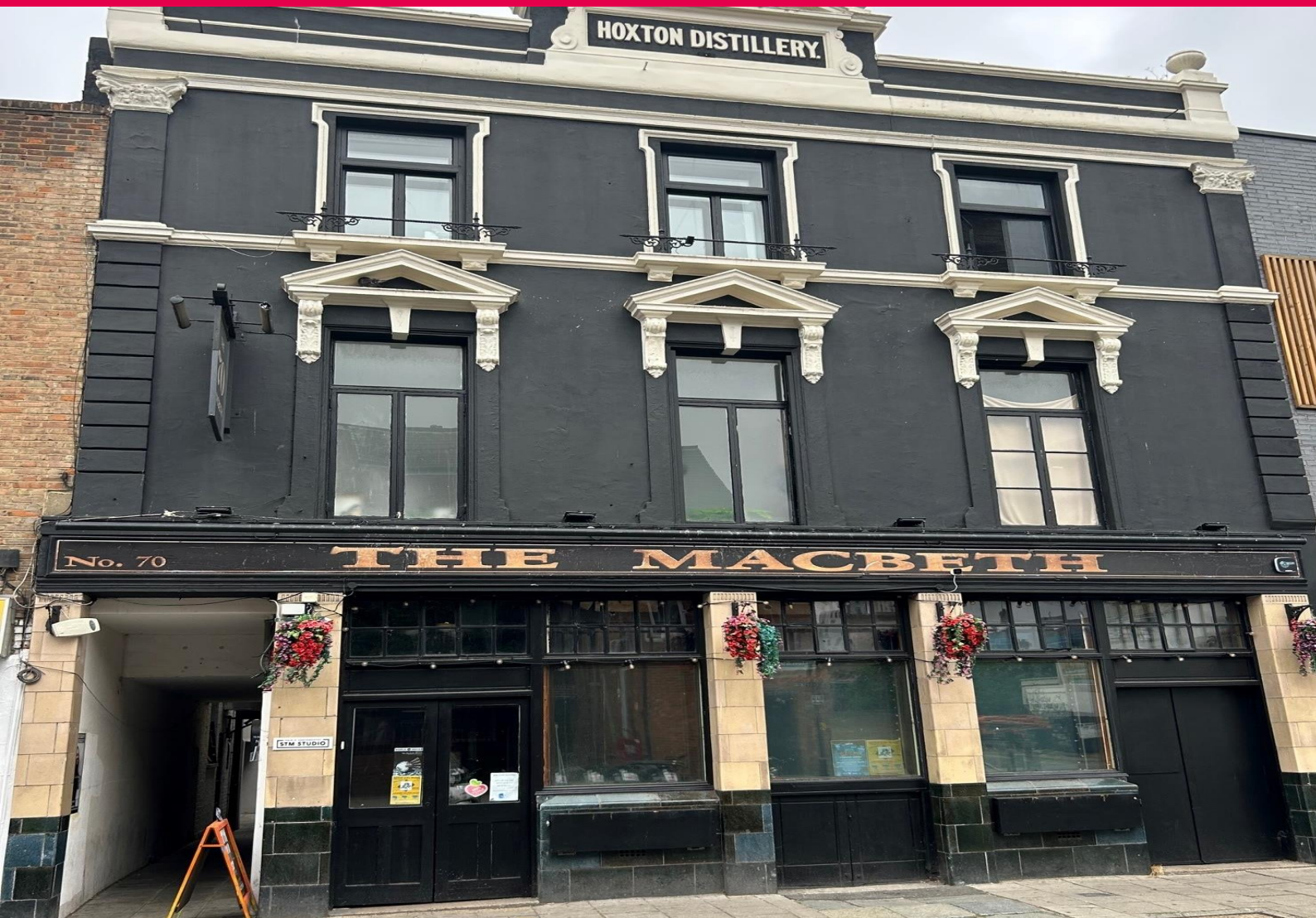
The Macbeth, 70 Hoxton Street, Hackney, London N1 6LP