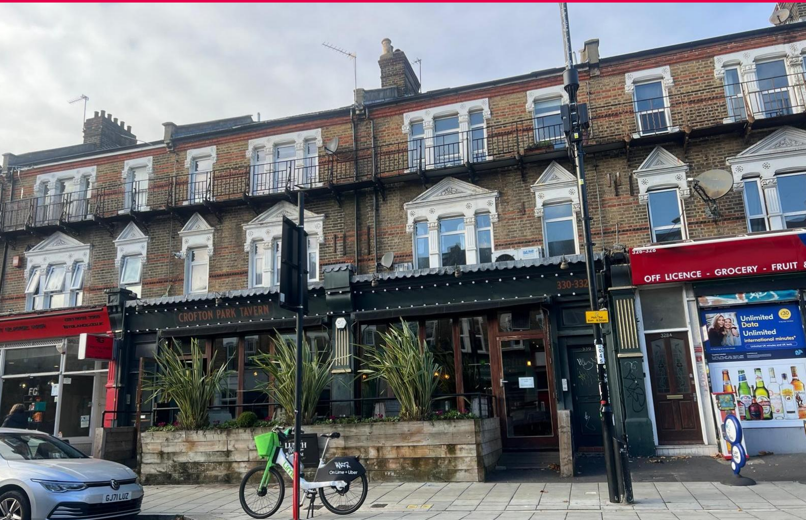
Crofton Park Tavern, 330-332 Brockley Road, London SE4 2BT