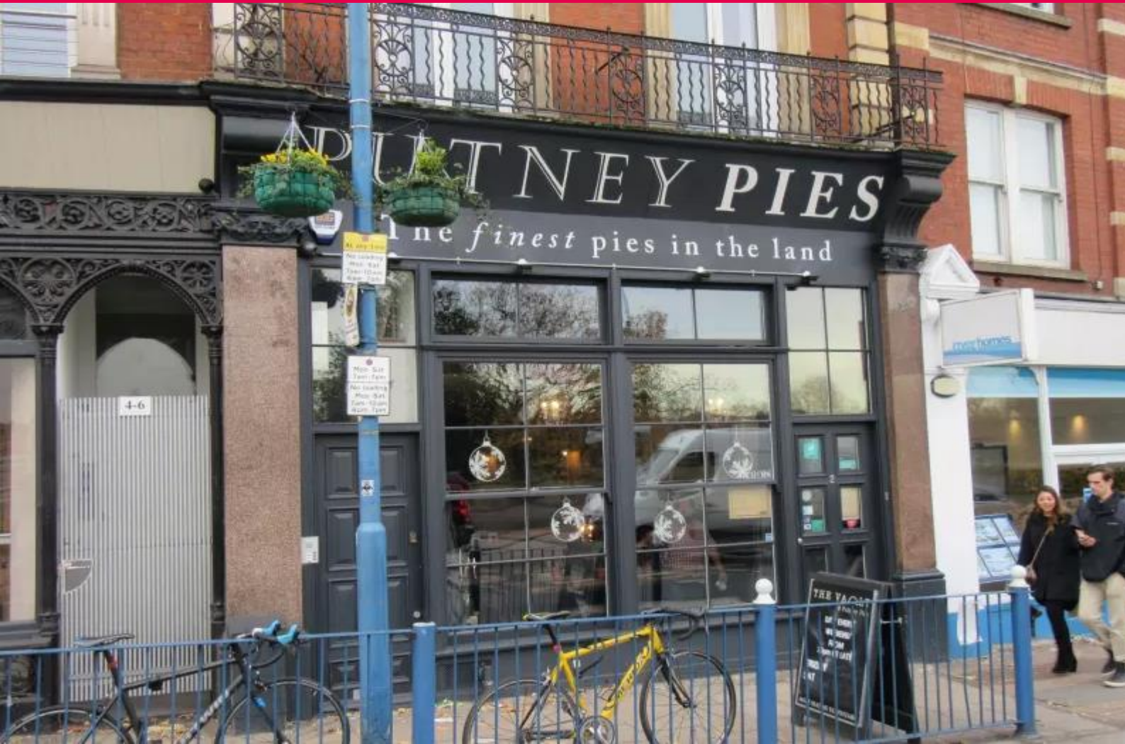
Putney Pies, 2 Putney High Street, London SW15 1SL